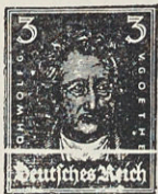
Johann Wolfgang Von Goethe