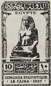
Amenhotep IV Pharaoh Of Egypt About 1420 B.C.E.

Recently we read the weekly portion of our Torah dealing with the story of Joseph's sad plight in Egypt, his rise to eminence, and the subsequent settlement of his father, Jacob, and his family in Goshen. This happened during the reign of Amenhotep IV, who not only learned a great lesson in political economy from Joseph when the latter explained the meaning of the King's dream but, it is reasonable to assume, got his first conception of monotheism soon after his close association with Joseph and, thereafter, with the patriarch, Jacob.