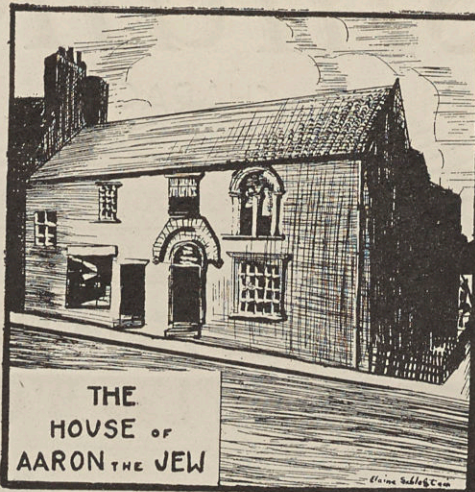
THE HOUSE OF AARON THE JEW

Aaron's activity was not confined to financial transactions of this description. In commerce also his mastermind attained a position of eminence, and, among the records of the period are to be found references to his dealings on a considerable scale in articles of general consumption.