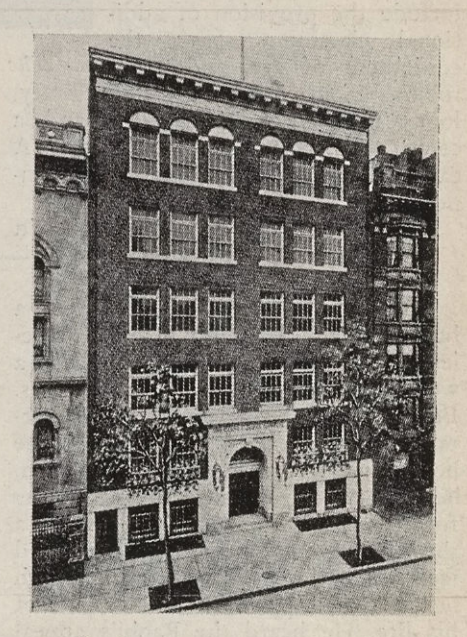
Our new Community House and School Building

We are now the owners of a modern and up-to-date building which we plan to operate as a community house. In it will also be housed the Ramaz School and an afternoon religious school under our auspices. We have every reason, therefore, to be proud of a glorious