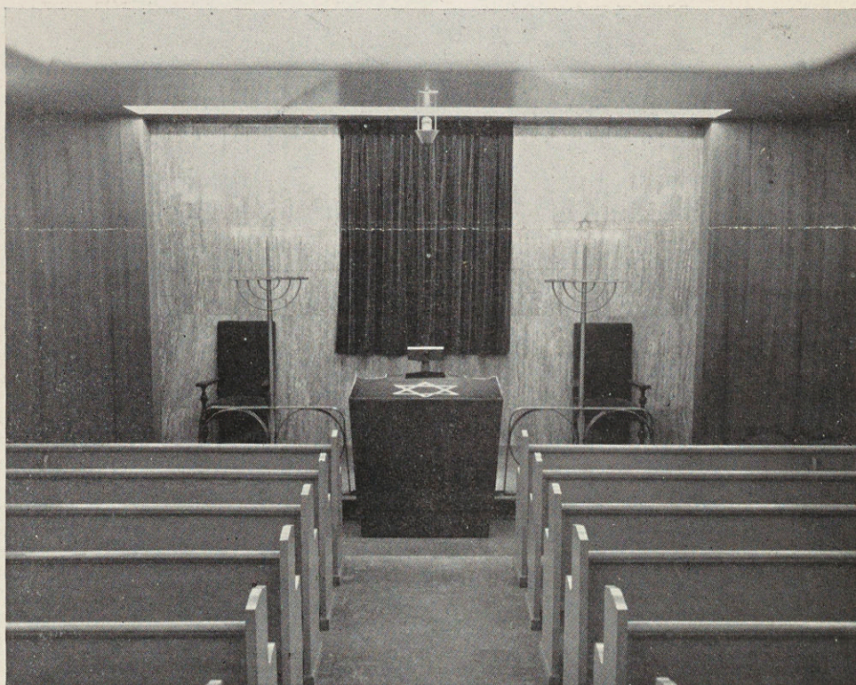
View of the new Chapel in the Main Synagogue, showing the Altar and Holy Ark