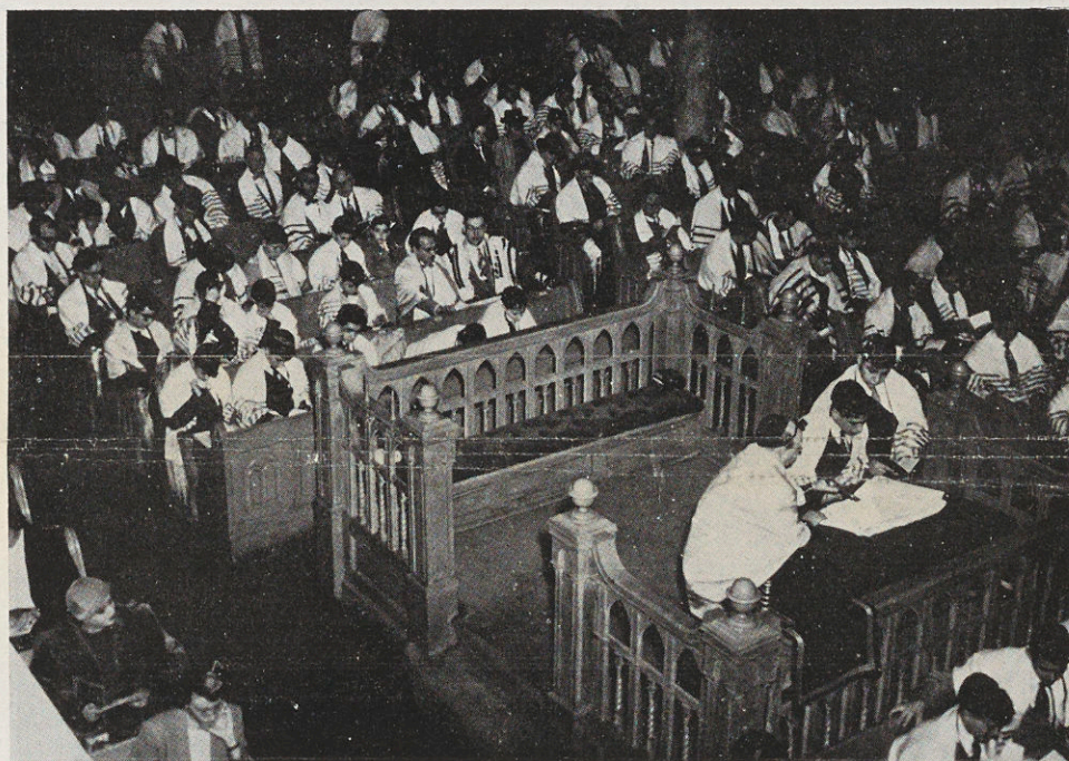
Some of the many worshippers who attended our Purim Services Sunday morning, are shown listening to the Reading of the Megillah in the above picture.