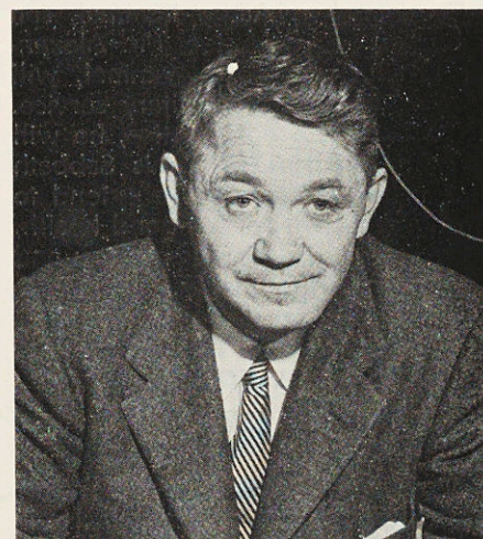
Henry Steele Commager

Prof. Commager believes that there has been a good deal of stuffily written American history and he has expended much effort in raising the literary level of history books. In this respect he has been eminently successful. His better known books include, "The American Mind", "The Heritage of America", "America, the History of a Free People", and "Documents of American History".