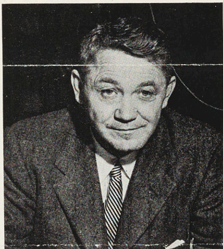
PROF. HENRY STEELE COMMAGER

Noted Historian, Author and Lecturer will speak on