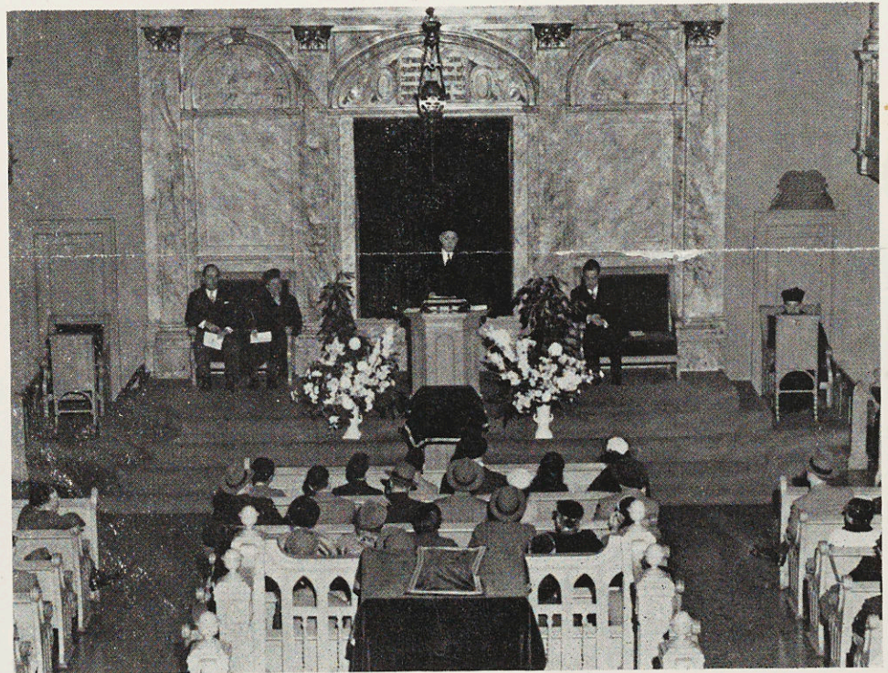
Prof. Henry Steele Commager delivers main address at our annual Thanksgiving Service

Especially important was the development of a government that did not intrude into the private lives of its citizenry and that governed without the fear of the people. These patterns are what gave America its strength and we must be ever on the alert to guard them.