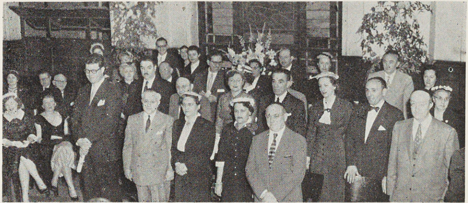
INDUCTION OF NEW MEMBERS: New members rise to be inducted into Kehilath Jeshurun at Annual Membership Meeting.