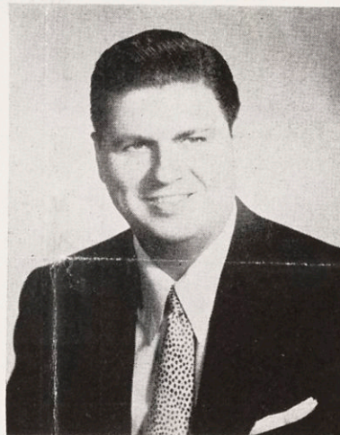
HON. MAXWELL M. RABB