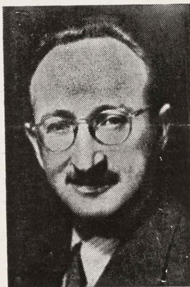
Prof. Sidney Hook

Sidney Hook is one of the leading philosophers and educators of his generation in America. His ideas and writings have won attention not only in academic circles but in democratic social movements throughout the country. His work is also well-known abroad.