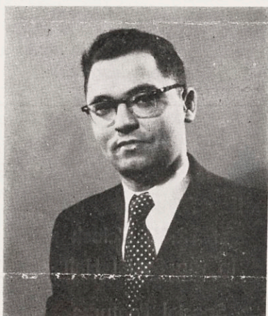
RABBI MOSES TENDLER