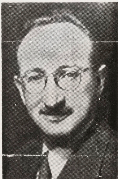
PROF. SIDNEY HOOK

Famous Philosopher, Educator and Lecturer