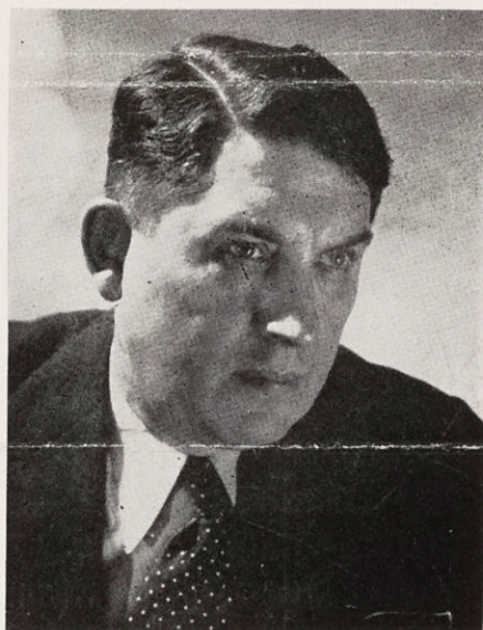
DR. PIERRE VAN PAASSEN

This Thursday, November 22nd, at 11:00 A.M.