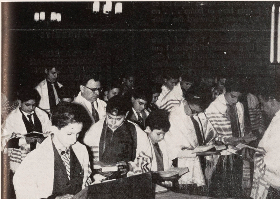
Two generations join in prayer at the Men's Club Father - Son Minyan

Amidst all the gratification that is derived from the Minyan there is one disturbing note. Not enough fathers and sons from the congregation take advantage of this unique educational opportunity. At this midpoint in our season, we should like to extend an invitation to all the members of the synagogue to come down this Sunday at 9:30. We hope to see you there in person!