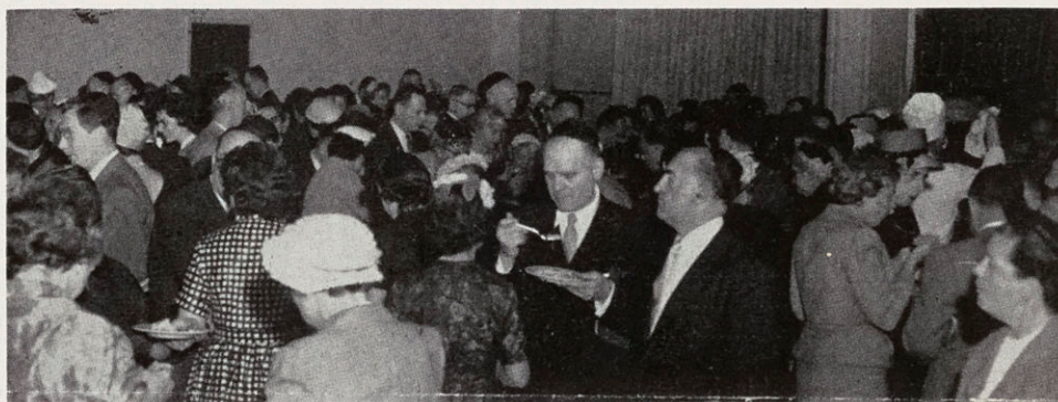
A partial view of the membership after the 87th Annual Meeting enjoying the reception and buffet in the Social Hall.