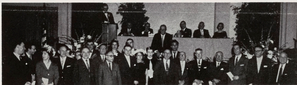
More than thirty of the Adult Institute students who received certificates for the successful completion of various courses during the year at the synagogue.