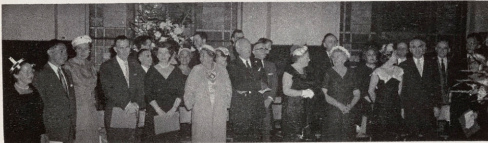
A group of new members are shown listening to words of welcome, following their formal induction as members of Kehilath Jeshurun.

After the meeting was adjourned, the membership assembled in the Social Hall at an elaborate Buffet Reception. The spirit of sociability was heart-warming. Those who were there for the first time realized what our veteran members knew for a long time—Kehilath Jeshurun is, indeed, a happy family.