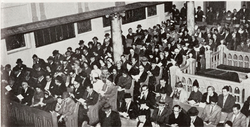
Below: A partial view of the more than 500 participants at the service.