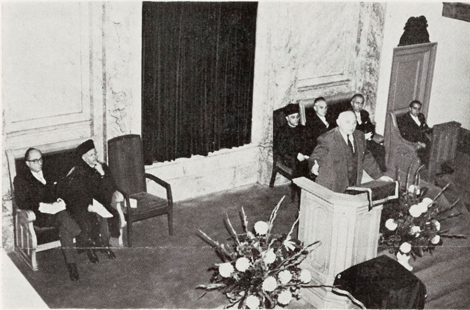
Above: Dr. Salo W. Baron delivering address at the Thanksgiving Day Service.