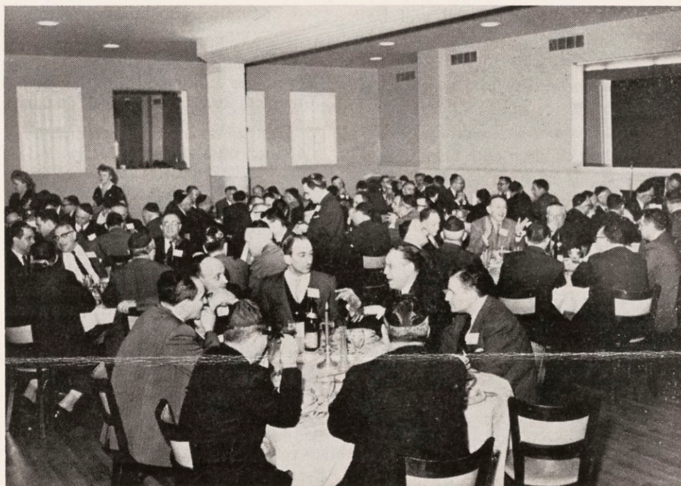
A partial view of the participants at the Men's Club Twenty-Second Annual Dinner held recently.