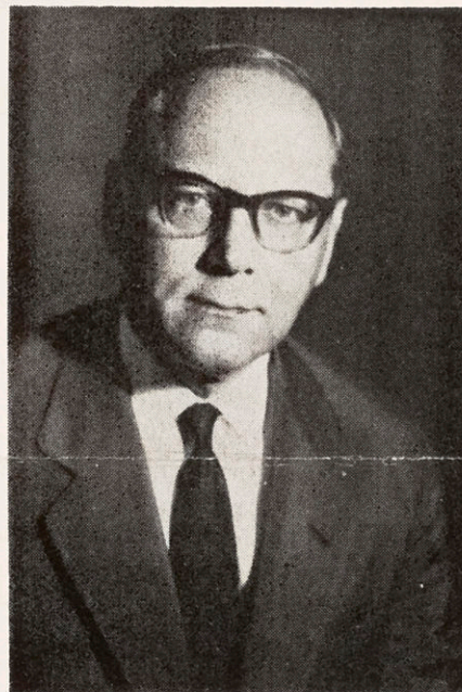
HON. BINYAMIN ELIAV

Consul General of Israel in New York City