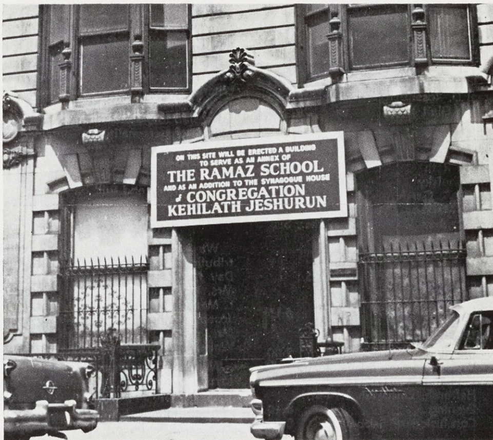
The building shown above adjoins the Synagogue House. The sign thereon announces plans for the erection of a new building for the Congregation and for Ramaz.