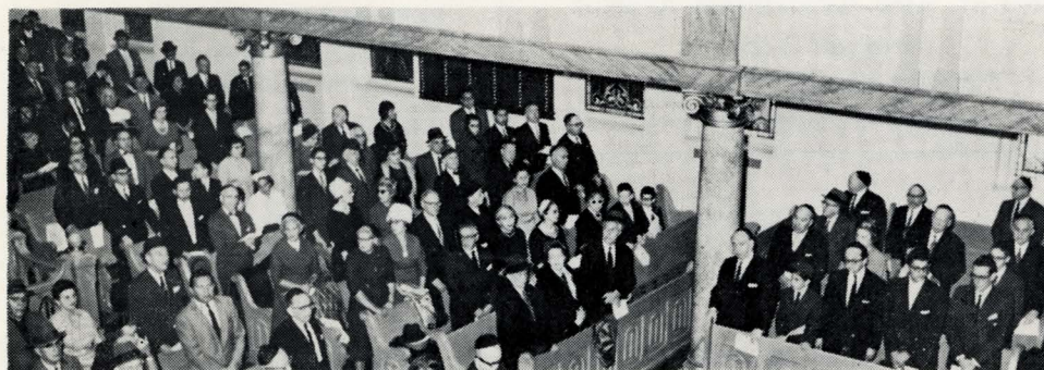
A partial view of the more than 600 worshippers at our Thanksgiving service, standing for the singing of the Star Spangled Banner.