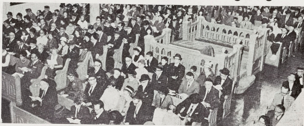
A partial view of the many worshippers who attended our Thanksgiving Service.