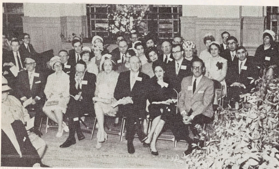
A view of the newly inducted members seated in a special section