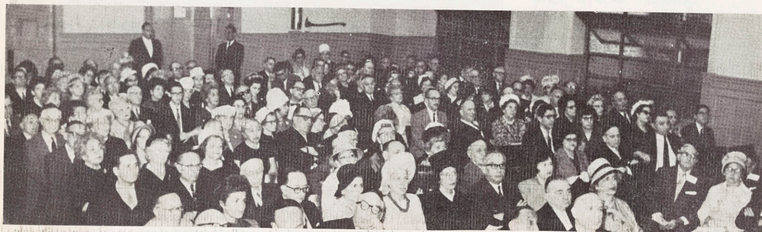
A partial view of the capacity attendance at the Annual Meeting.