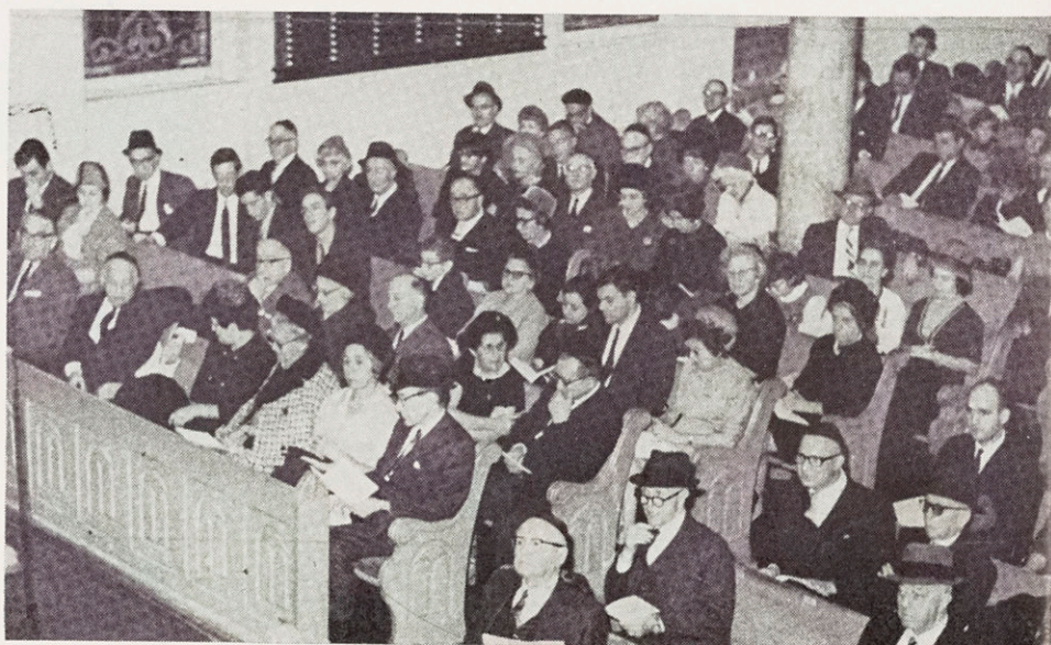
A partial view of the worshippers participating in the Thanksgiving Day Service