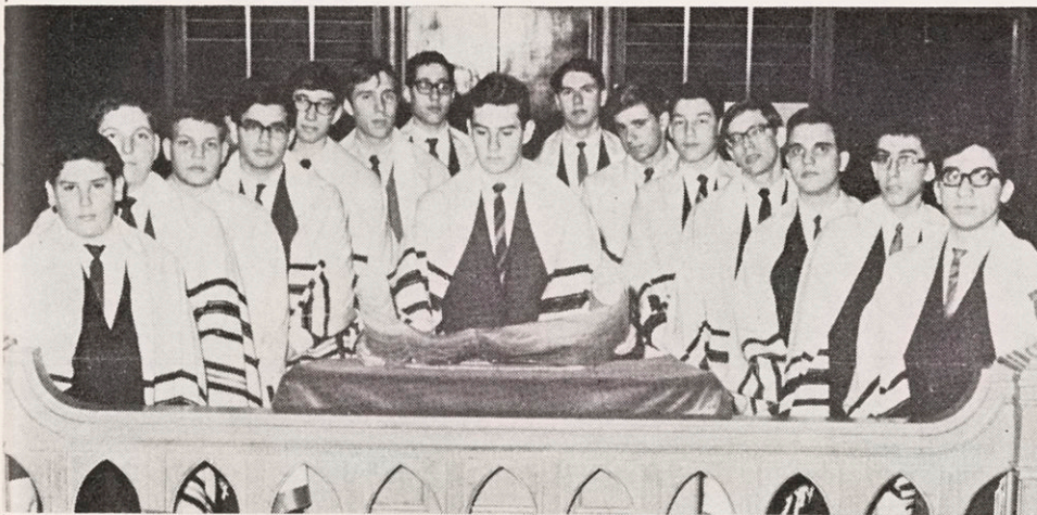
Ramaz Students who will serve as Cantors and Readers at the Sunday morning Purim Service, left to right:

Sunday morning, March 26th, 9:15 o'clock