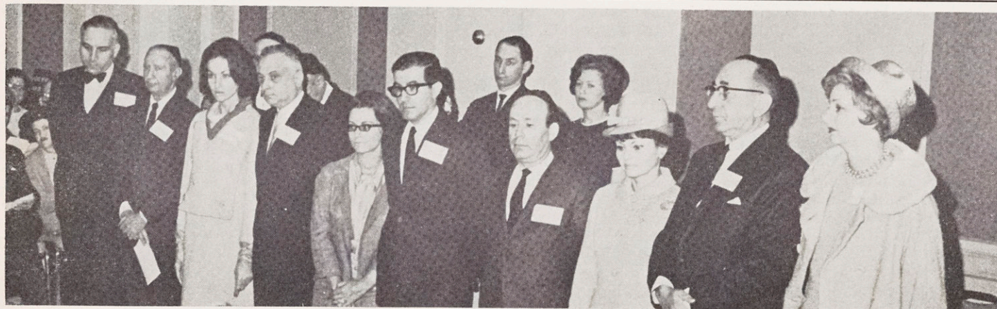
A view of some of the new members as they are officially inducted into membership.