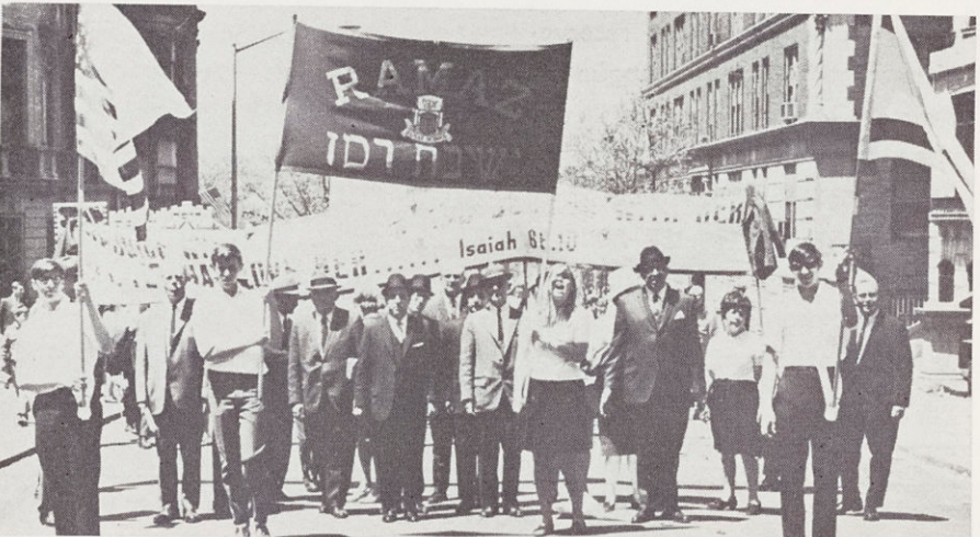
Shown above are members of the Ramaz School Administration and Faculty leading the students in the "Salute to Israel" held before the Summer.