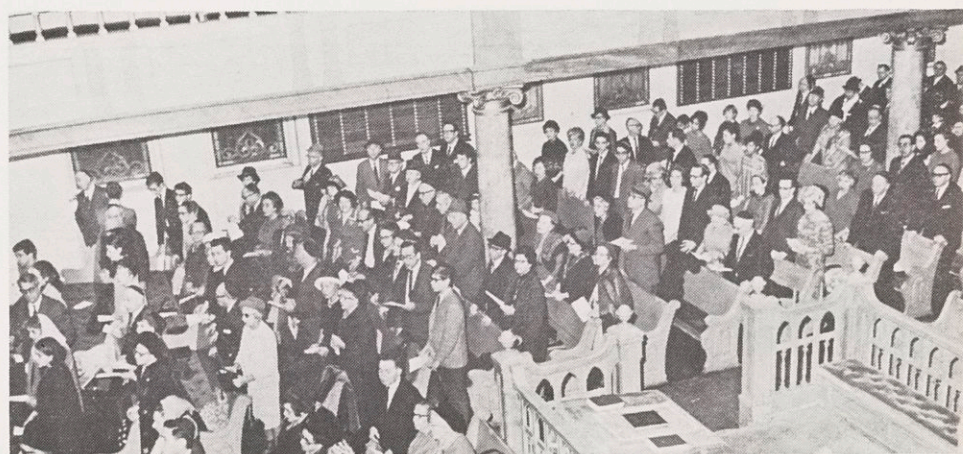
A partial view of worshippers at the Thanksgiving Day Program.