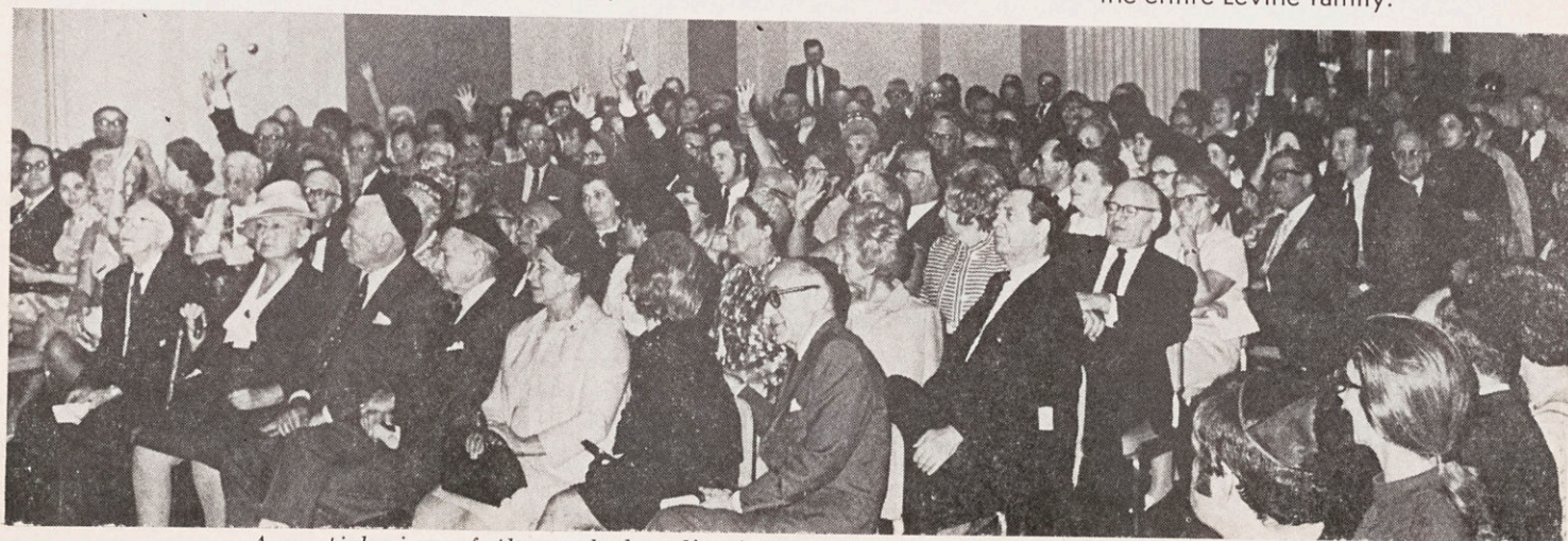
A partial view of the packed auditorium during the Ninety-Eighth Annual Meeting.