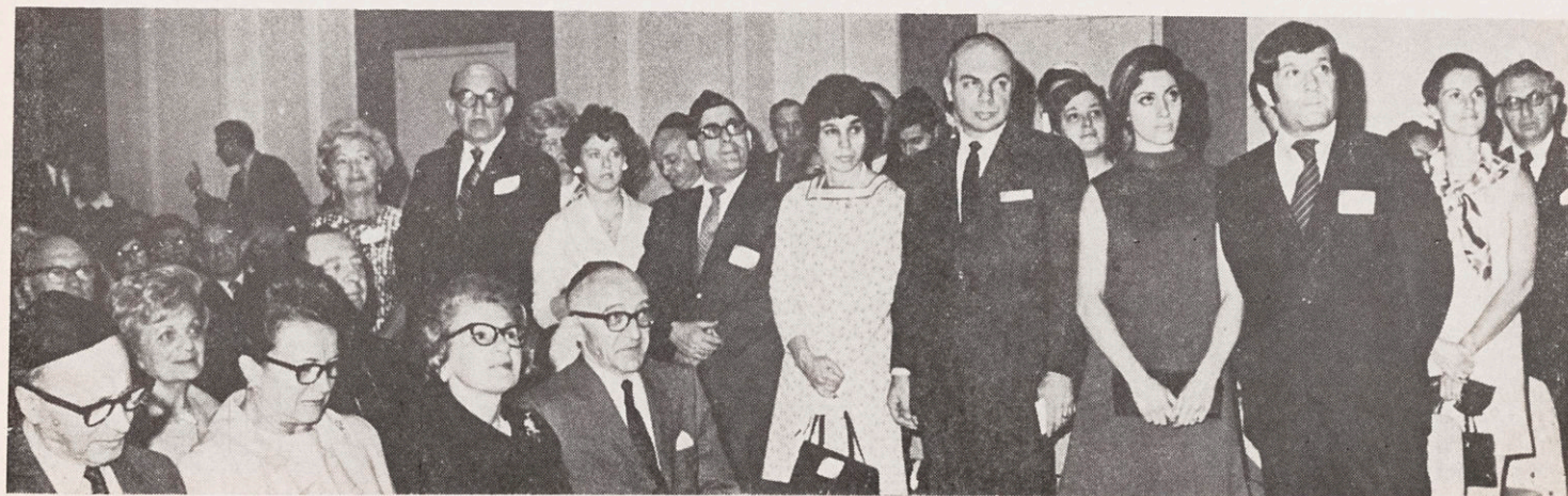
A partial view of the new members of the congregation being presented to the Ninety-Eighth Annual Meeting.