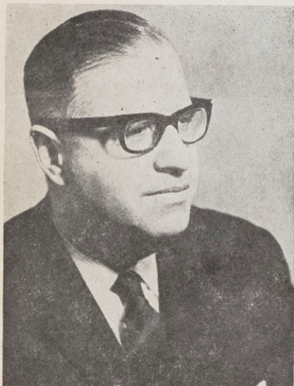
Hon. Abba Eban